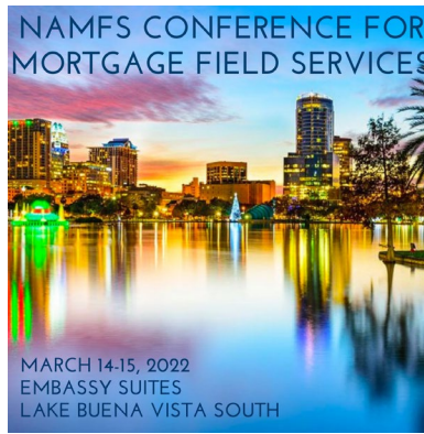
EXHIBIT INTERACT ENGAGE

This meeting is the premier educational event for mortgage field service professionals, drawing hundreds of delegates each year. For NAMFS industry partners and related organizations, this event is an unparalleled opportunity to make and solidify relationships through person-to-person communications and marketing. Our attendees are also very enthusiastic about interacting with you to discuss the latest technologies, products, and services