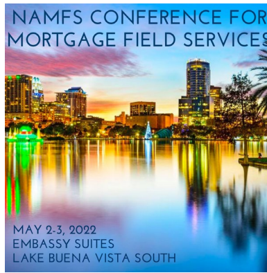
EXHIBIT INTERACT ENGAGE

This meeting is the premier educational event for mortgage field service professionals, drawing hundreds of delegates each year. For NAMFS industry partners and related organizations, this event is an unparalleled opportunity to make and solidify relationships through person-to-person communications and marketing. Our attendees are also very enthusiastic about interacting with you to discuss the latest technologies, products, and services